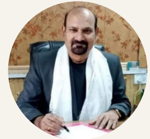
PATRON REGISTRAR UNIVERSITY OF LADAKH