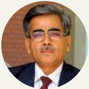
CHIEF PATRON VICE CHANCELLOR, UNIVERSITY OF LADAKH